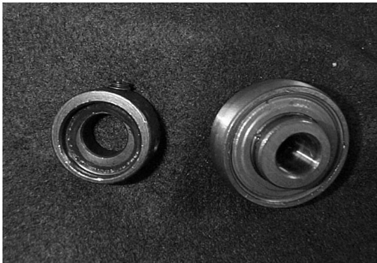
Picture 2 : Self -locking Collar, Radial Ball Bearing with Spherical O.D., ½ in. I.D. (4)